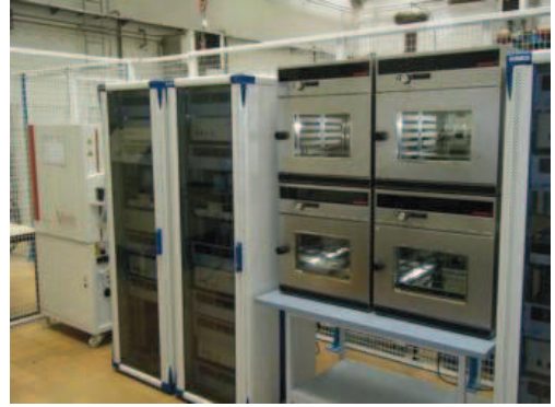
Fig. 2. Experimental setup for accelerated ageing tests

This study is a part of a research project whose aim is focused on the electric motors & electronics for aeronautical applications in more electrical aircrafts. Two levels, a minimum and a maximum value, were defined for each stress with respect to this specific application.