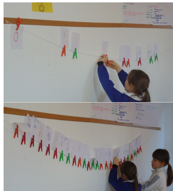
Figure 4: String on the wall where the position of the unit is made to vary dynamically sliding the corresponding label attached with a clothes’ peg

Actually, from now on color is no longer used and the labels are referred to points on the number line. We can therefore claim that fractions here have assumed the role of rational numbers. The teacher could take advantage of this transition to construct a new tool of semiotic mediation, developed from the preceding artifacts. The “narrow strip” now becomes a concrete artifact (Figure 4): it turns into a piece of string on the wall, upon which 0 is placed at the left end and the position of the unit is made to vary dynamically sliding the corresponding label attached with a clothes’ peg. The dynamic component of this artifact recalls certain software (such as AINuSet, GeoGebra, Cabri2...) of course with evident differences, including the fact that as the unit (the position of the paper card with written “1”) is made to vary, the positions of the other whole numbers and fractions do not vary dynamically at the same time or automatically, as a consequence of the new placement of the unit: their motion requires