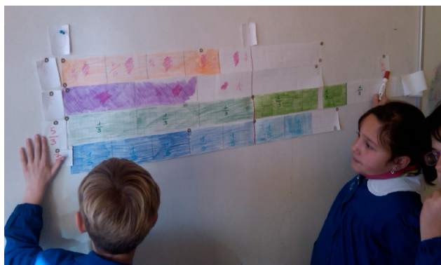
Figure 1: Four strips of squared paper where students had positioned a certain unit of measure and had defined unit fractions and colored fractions ( 4/5, 2/3, 5/3, 7/5 )

ACTIVITY 2, SESSION A. A certain unit of measure is given (for instance, a unit measure corresponding to 15 squares). The students are asked to position it on the strip of squared paper and to place and color on the strip unit fractions like 1/5, 1/3 , etc.