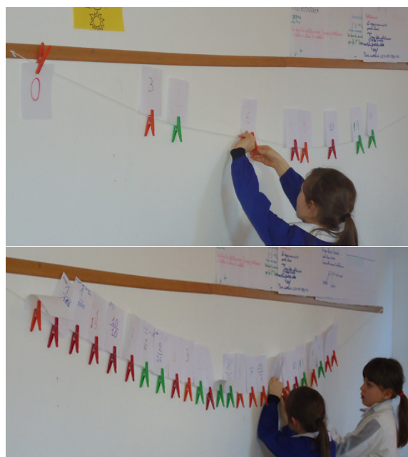
Figure 4: String on the wall where the position of the unit is made to vary dynamically sliding the corresponding label attached with a clothes’ peg

Actually, from now on color is no longer used and the labels are referred to points on the number line. We can therefore claim that fractions here have assumed the role of rational numbers. The teacher could take advantage of this transition to construct a new tool of semiotic mediation, developed from the preceding artifacts. The “narrow strip” now becomes a concrete artifact (Figure 4): it turns into a piece of string on the wall, upon which 0 is placed at the left end and the position of the unit is made to vary dynamically sliding the corresponding label attached with a clothes’ peg. The dynamic component of this artifact recalls certain software (such as AINuSet, GeoGebra, Cabri2...) of course with evident differences, including the fact that as the unit (the position of the paper card with written “1”) is made to vary, the positions of the other whole numbers and fractions do not vary dynamically at the same time or automatically, as a consequence of the new placement of the unit: their motion requires