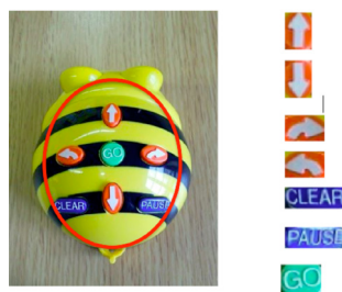
Figure 1: Bee-bot's back

The bee-bot (Figure 1) is a small programmable robot, especially designed for young students. Its ancestor is the classical LOGO turtle, originally a robotic creature