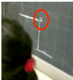
Figure 2: Sign for the right angle

In both these cases, however, the angle was the external angle, i.e. the region swept by the gaze of either the student or the bee-bot while changing direction. When the researcher proposed to draw the paths in a “faster way: using a mark like the one the bee-bot