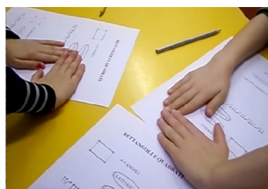
Figure 3: The students’ gesture

First we describe the hands-meeting gesture ( type c ). While exploring figures that represented rectangles, including squares, a powerful gesture was realized by one of the groups of children and rapidly imitated by others: the two hands coming together at a right angle (Figure 3). The gesture emerged as the students tried to explain the property that all squarized O’s (be they “allungati” [stretched] or “perfetti” [perfect]) had in common: all the four angles (internal angles) are equal and right. Moreover the gesture stresses the vertex as an important feature of the angle. Signs of type d were identified, for example, in the argument presented below (Figure 4), on how the angles of a square or rectangle have to be (as opposed to angles such as the ones of the parallelogram that was included in one of the worksheets).