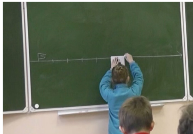
Figure 1: Marking the number line with an arbitrary unit

The Russian teacher, Olga, began by sketching a horizontal line across the board, telling her class that this was a number line before asking what was missing. Over the next two or three minutes, four volunteers, with appropriate commentary from Olga, completed the number line as follows. The first drew a small arrow at the right hand end of the line to signify that numbers go from left to right also extend indefinitely. The second drew a small flag near to the line’s left hand end to represent the start or zero point. The third, using what looked like a postcard, added regular intervals, as shown in Figure 1. The fourth added the integers correctly.