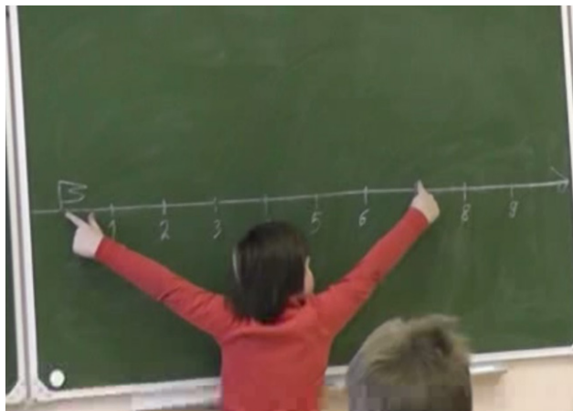
Figure 2: A demonstration of seven on the number line

dent with the mathematics. On Olga's invitation, she counted out to seven, while keeping her left hand forefinger at the flag (zero). Next, she was invited to count back three spaces, which she did. Olga asked the class what the girl's action signified and was told that she had subtracted three from seven to get four.