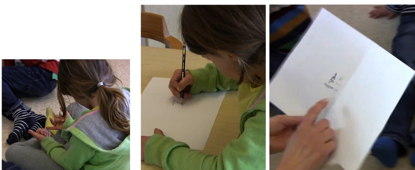
Figure 3: Lova's problem solving

Lova: Because the woodworking group, it's many more who like to do woodwork, less who like to paint and in between who like baking. (För att snickargruppen, det är mycket mer som tycker om att snickra, mindre som tycker om att måla och mittemellan som tycker om att baka.)