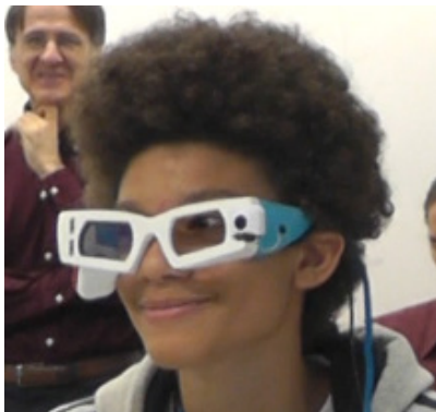
Figure 1: The gaze tracking device

The video recording we analyse shows a teacher explaining the topic of linear equations and relating