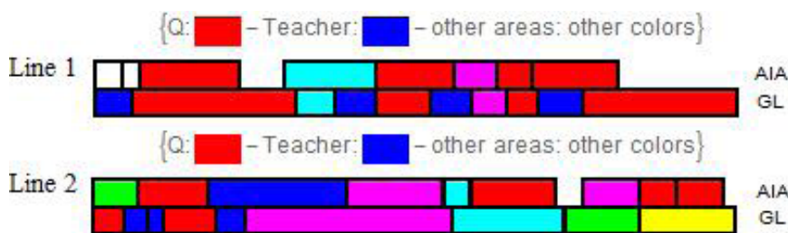
Figure 4: Segment interlacing for the transcripts above