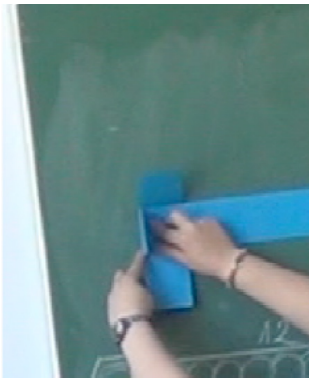
Figure 2: Teacher explaining through cardboard

8 Teacher: The less glasses touching the walls, the less quantity of cardboard.