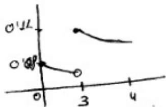
Figure 3: Inductive reasoning from the model (Example 9)

Example 9. “[Lim_Left] The patient eliminates 0.02 mg per day. [Figure 3 provided]”