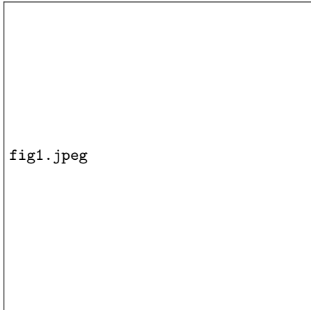
Figure 3: The different ergodic MoG-HMM models appropriated to each phase

proposed features and a classic single vector representation of the user behavior during the event.