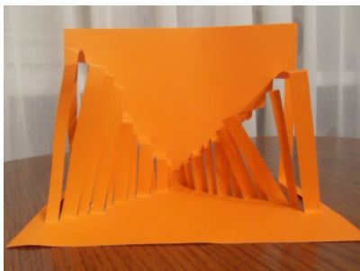
Figure 3: Filip's work

Filip first created a “test card”. He worked quickly, did not pay attention to accuracy. When the card