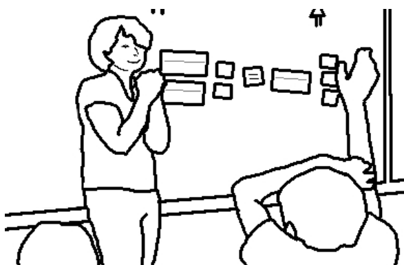
Figure 1: The envelope equation can be seen on the blackboard in the background

children have the same amount of hockey cards. How many hockey cards are in an envelope?