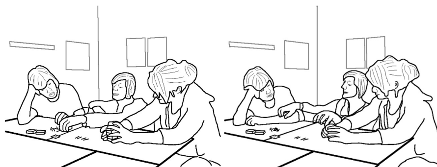
Figure 3: The two gestures in the first scene: Pointing at the right side of the equation (left) and highlighting the equality of the two sides (right)

A closer analysis of this first scene reveals that there are two gestures (see Figure 3). First, the teacher briefly and unspecifically lays her hand on the right side of the table and refers to this gesture by the word “here”. Her idea is to focus on one side of the equation. However, at the same time the equation must stay an equation, which the teacher tries to stress by saying “so that it stays the same”. The pronoun is concretised by the gestures shown in the right image: She means that the number of matches on both sides stays the same. This is too complex for the students, as neither the matches nor the sides of the equation are explicitly named as the relevant objects. Of course, this problem also applies to the aforementioned gesture. As a result, the students can make no sense of the teachers hint.