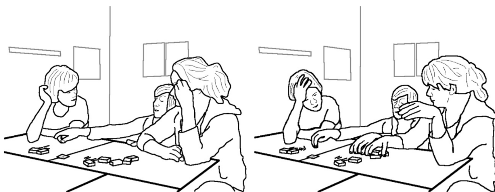
Figure 4: The two gestures re-enacted: Indicating the relevant side of the equation (left) and making clear that equality must be preserved (right). See Figure 3 for comparison