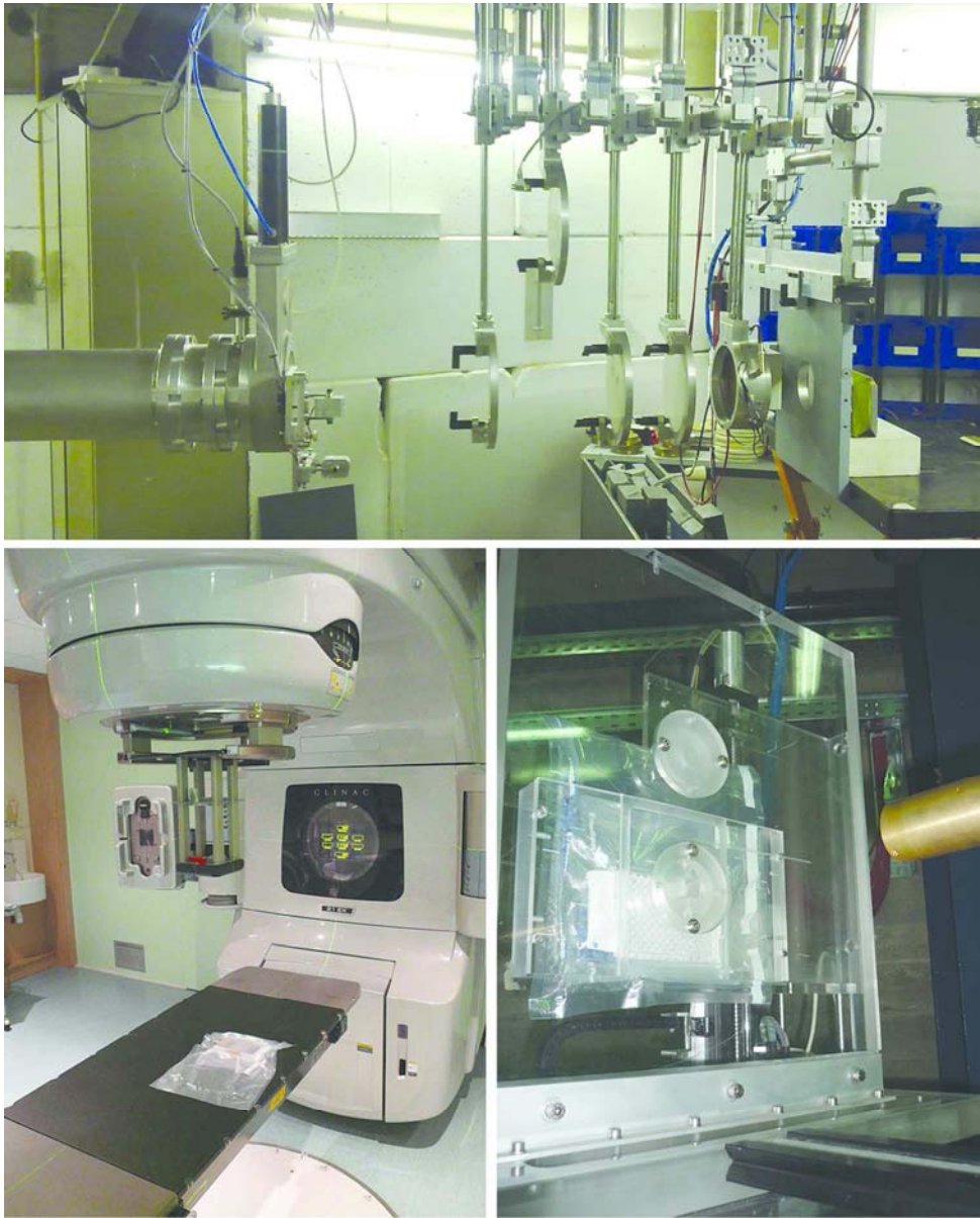
99x124mm (300 x 300 DPI)