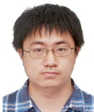
member of the IEEE.