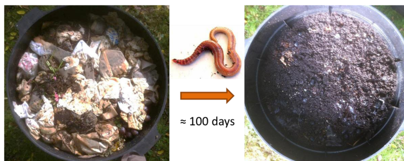
Fig. 1 Vermicompost can be obtained in about 100 days from domestic organic wastes when processed by the earthworms Eisenia fetida or Eisenia andrei .

To design crop management systems that consider the value of earthworms explicitly, it is necessary to assess the earthworm-mediated ecological services that occur in cropped fields and to review the effects of cultivation practices on earthworm diversity, abundance, and activity. In this paper,