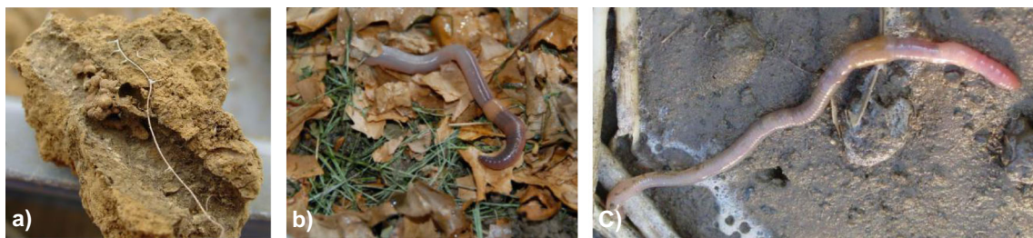
Fig. 3 a Earthworm gallery in a compacted clod of loamy soil in Northern France (credit C. Pelosi). b Anecic earthworm Lumbricus terrestris (credit S. Barot). c Endogeic earthworm Apporectodea rosea (credit C. Pelosi)

Earthworm burrows affect water availability to crops. Blouin et al. (2007) showed, studying rice growing in a greenhouse, that the presence of the endogeic worm Reginaldia omodeoi , formerly known as Millsonia anomala , had a positive effect on plant growth in a well-watered treatment, but a negative effect in a water-deficient treatment. This was attributed to lower water availability to rice caused by lower soil water retention capacity in the presence of this compacting earthworm. However, preferential water flow occurred in macropores created by earthworms. This has been documented for different soil types: rice paddy soils (Sander et al. 2008), temperate loamy soils (Capowiez et al. 2009), and temperate clay soils (Jarvis et al. 2007). Preferential flow increases the risk of leaching and subsequent contamination of subsurface and groundwater by nitrogen and pesticides (Ritsema and Dekker 2000; Blackwell 2000). However, the action of earthworms on soil porosity generally has a positive effect on the soil water regime (Ehlers 1975; Clements et al. 1991; Pitkänen and Nuutinen 1998). Clements et al. (1991) showed that, after 10 years of earthworm inoculation, the water infiltration rate increased from 15 to 27 mm h -1 . In Mediterranean soils, water percolation was found to be positively correlated with earthworm biomass, burrow length, and burrow surface with r value of 0.66, 0.65, and 0.77,