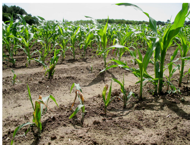
Fig. 1 Damage caused by wireworms in a maize field. Possible symptoms include a reduction in seedling density, mortality of young plants, reduction in plant growth, abnormal tillering, and presence of a bleached stripe on central leaves

The main purpose of our study was to assess the influence of the local landscape features and agricultural practices on the level of wireworm damage characterized by the proportion of the damaged area in a field. To diagnose fields at risk for