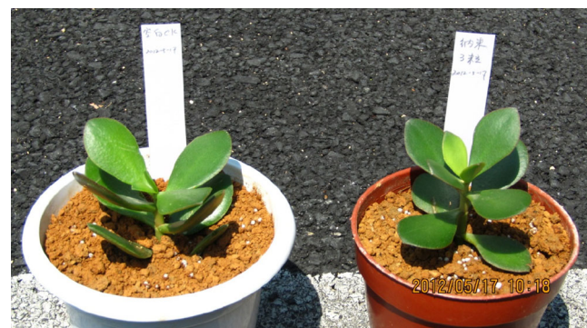
Fig. 3 Jade plant ( Crassula argentea ) treated with nanomaterial and the growth of new leaves were promoted (yellow pot) compared to the control (white pot) (10 days after treatment)