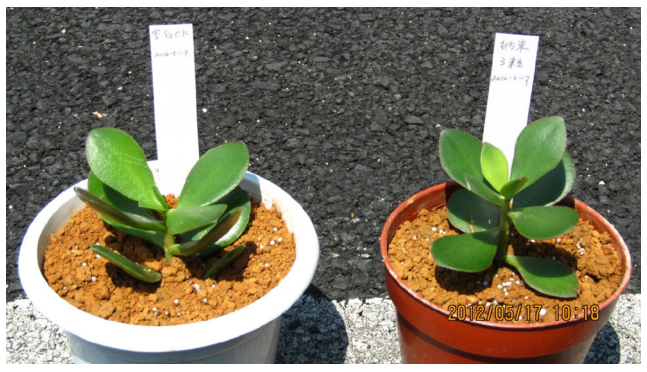
Jade Plant (Crassula argentea) (control, left) and treated with nanomaterial (right)