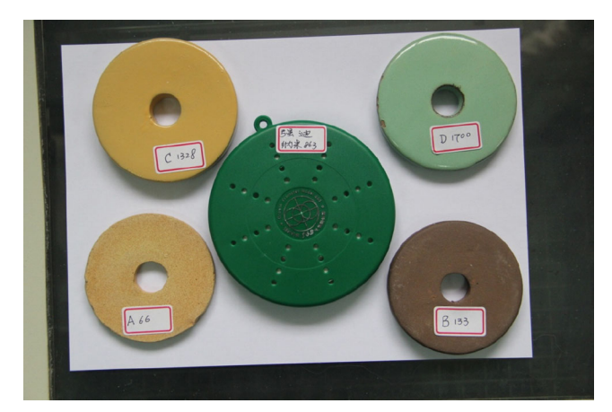
Fig. 1 Different types of biological assistant growth apparatus ceramic discs. Qiangdi nano-863 (the biggest green one in the center ), Suzhou Zhongchi ( a , b , c , and d discs around )

The functions of nanotechnologies in the promotion biological metabolism have been applied in many aspects. For example, seed treating or irrigation (watering) with treated water by nanotechnology devices can promote the crop growth, increase the yield, and improve the quality of many crop products, including cereal crops and cash crops. Although nanotechnology application in food and agriculture is in its budding stage, we hope to see increasing uses of tools and techniques developed by nanotechnologies in agricultural fields in the next few years (Tuteja and Singh Gill 2013).