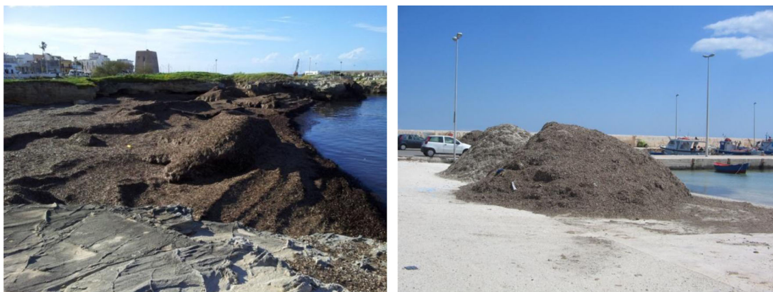
Fig. 1 Posidonia residues cause problems to coastal municipalities that are forced to remove them and to disposed in landfills resulting in both environmental and economic charges, due to the loss of organic matter and disposal costs

The study was carried out in the farm of the “Agricultural Research Council” (CRA) situated in Monteroni di Lecce, Italy (40° 19' lat N, 18° 5' long E, alt. 30 m a.s.l.) from May 2011 to April 2012 with two consecutive crops: tomato and oak leaf lettuce. The mean annual temperature of the area is