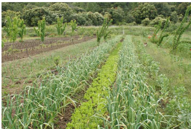
Fig. 1 Organic open-air vegetable cultivation in South Spain

conventional cereal, in comparison with 361 kg per hectare of organic cereal (Table 2), with an average decrease of 65 % for organic products. The change was reduced to -42 % on a product basis due to lower yields under organic management, with emission values of 318 and 185 g CO 2 e per kilogram of conventional and organic product, respectively. The production of fertilizers was the main factor responsible for the differences observed, while C sequestration was similar between both types of management on an area basis. Our results for conventional grain production are in the lower range of global estimations by Nemecek et al. (2012) and in accordance with studies under Mediterranean climate such as that of Biswas et al. (2008).