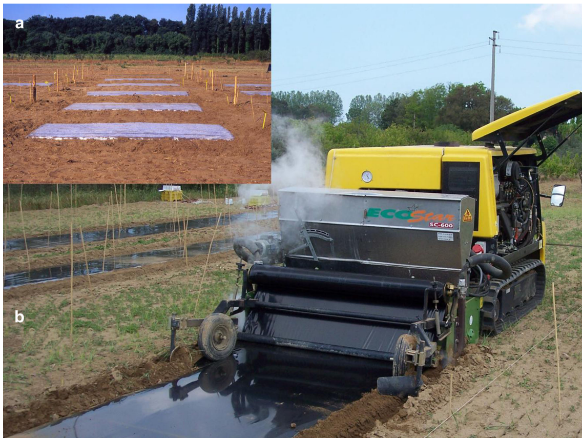
Fig. 1 Soil solarization (a) was carried out using three plastic films: transparent polyethylene film, ethylene–vinylacetate thermic clear film and high-effectiveness infrared film. Soil steaming (b) was carried out

Open-field soil steaming was carried out in San Piero a Grado (PI), central Italy, in July over a 2-year period. Plots of 1 m 2 were prepared, and randomized layouts with three replicates for a treatment/virus combination were used. Soil steaming was carried out using a self-propelling machine (Peruzzi et al. 2011) able to spread the exothermically reacting chemicals (1000 kg ha -1 of CaO or KOH) on the soil surface from a hopper, and then, they were incorporated into the soil by means of a rotor blade (Fig. 1). Behind the rotor, a steam injection system was positioned and connected to the steam generator via a feed pipe: this steam dispenser was filled at 40-cm depth by a system for the adjustment of rotor working depth. After the release of steam and exothermically reacting chemicals, a roller and ridging–mulching machine covered the soil with a plastic film. The steam discharge was 600 kg h -1 , with a pressure of 1.2 MPa. The injection system was 160 cm wide with 70 holes for steam dispensing. The treatments were carried out with a feeding speed of 60 m h -1 .