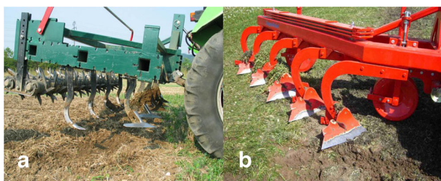
Fig. 1 Different farm tillage equipment used under reduced tillage. a A chisel with wide sweeps that undercuts weeds at 5 cm below the soil surface and with narrow sweeps that loosen the soil at 15-cm depth. b A stubble cleaner used for undercutting and turning the first 5 cm of soil

be higher, as well as the presence of perennial and grass species, which are more difficult to control (Gruber and Claupein 2009; Peigné et al. 2007; Santín-Montanyá et al. 2013). However, this trend is not always constant over time, and it is usually crop specific (Légère et al. 2013; Sans et al. 2011; Vakali et al. 2011). In a similar way, there are no clear results on the role of the tillage system on weed diversity (Hernandez Plaza et al. 2011; Sans et al. 2011; Santín-Montanyá et al. 2013), which is especially relevant for weed conservation because of the general low diversity of agroecosystems and the ecological and cultural values of the weeds (Clergue et al. 2005).