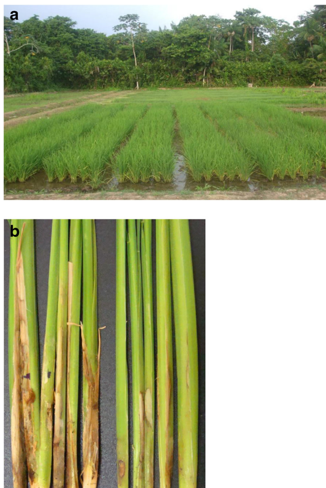
Fig. 1 Irrigated rice field experiment under tropical environmental conditions, favorable to sheath blight development ( a ). Rhizoctonia solani damage on untreated rice plants ( left ) or treated with Trichoderma asperellum , under field conditions ( b )

The genus Trichoderma (Hypocreales, Ascomycota) is known for its antagonistic activity against several plant pathogens, including R. solani (Harman 2006). There are many studies reporting that biological control with Trichoderma may be effective in minimizing the incidence of sheath blight in rice (Das and Hazarika 2000; Tewari and Singh 2005; Naeimi et al. 2010). However, most of them were performed in vitro and in the greenhouse (Naeimi et al. 2010) and only few reported efficiency under field conditions considering method of application in the plant (foliar spray or treatment of seed) and formulation. The main objective of this study was to develop an effective method of applying Trichoderma spp. for controlling sheath blight in rice under flooded conditions.