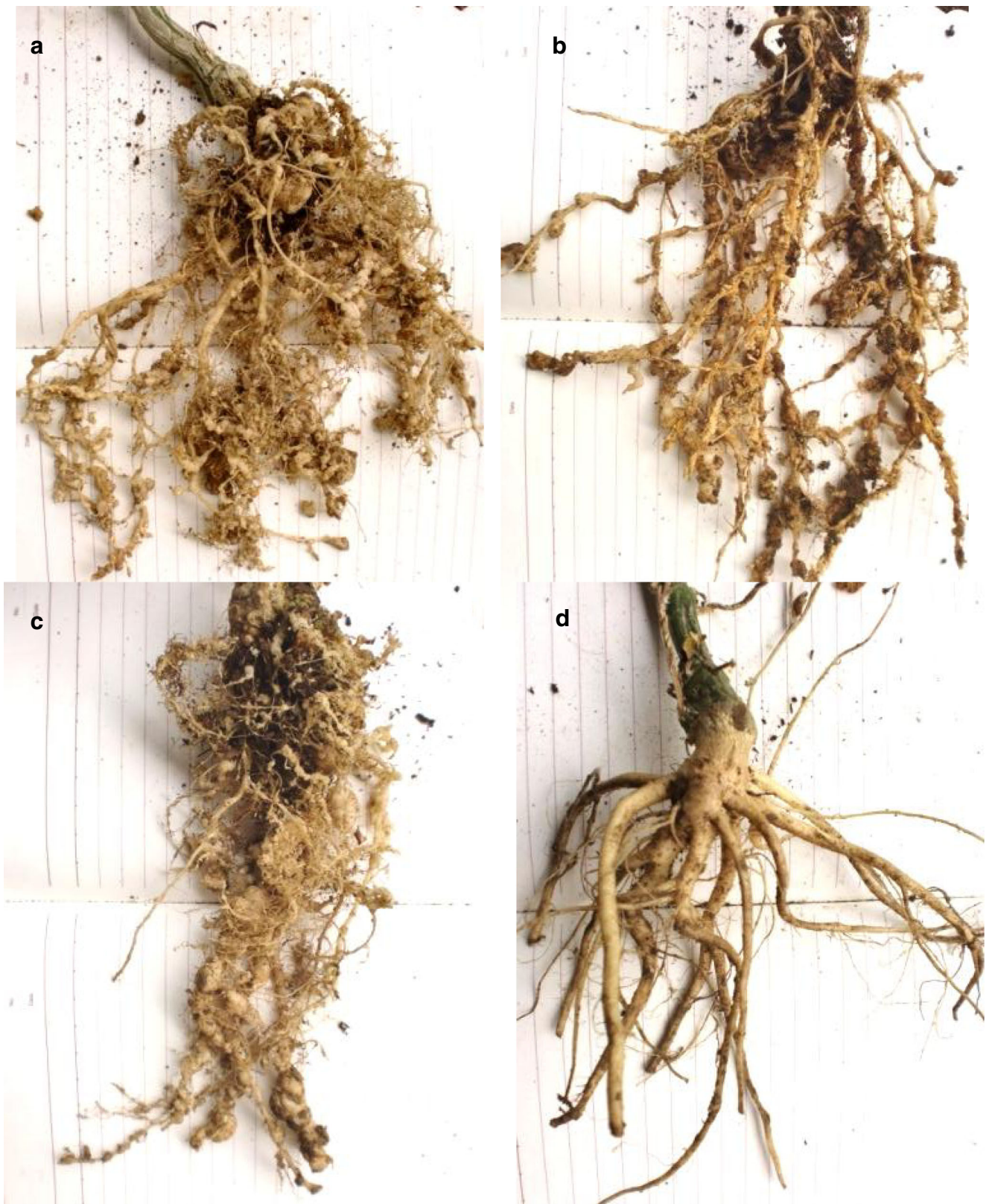
Fig. 3 Different rootstocks grown in a field infested with southern root-knot nematode, Meloidogyne incognita . Cucumis sativus (a), Cucumis melo (b), and Citrullus lanatus (c) rootstock exhibiting severe root galling

caused by root-knot nematodes, and Cucumis pustulatus (d) rootstock resistant to root-knot nematodes