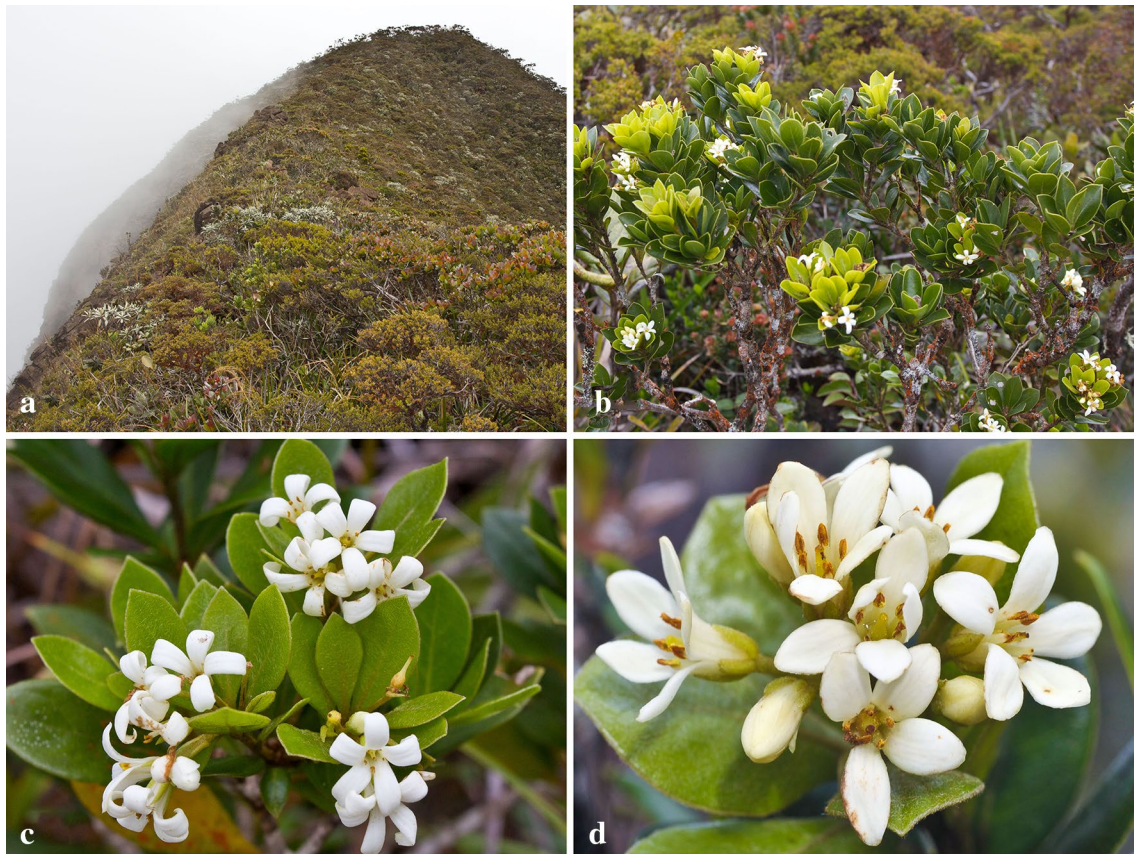
Fig. 1 Pittosporum peridoticola in the field: (a) Habit of plant growing on ultramafic bedrock; (b) Whole plant; (c) Inflorescence; (d) Detail of inflorescence.

2574—Tambuyukon ridge second peak; SNP 30597. Specimens were all flowering and collected by Van der Ent et al.