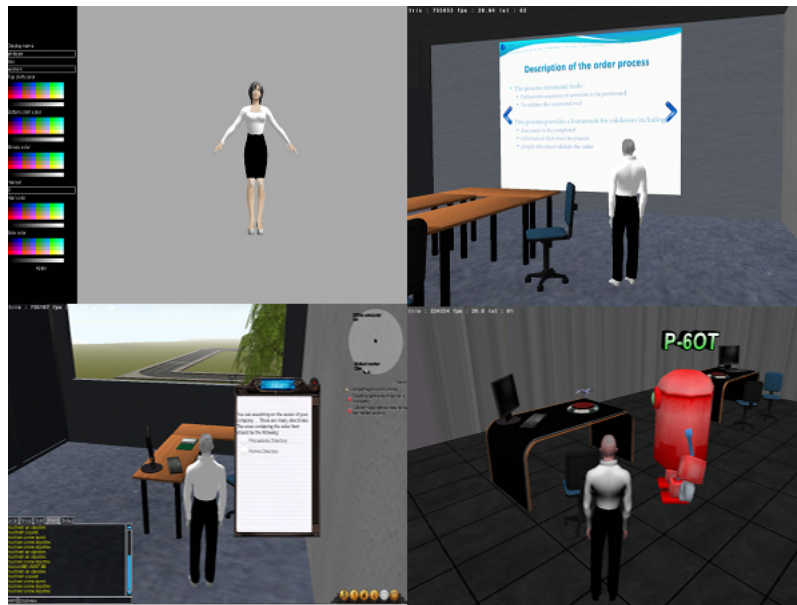
Fig. 1. Screenshots of the Learning Adventure ( LA ) environment

In the PEGASE project, the gaming environment is associated to a content platform (Audros). This content platform is a PLM system very used in SME/SMI. Moreover, a Trace-Based System (TBS) captures the behavioral traces and activity traces. These traces are essential to monitor the progress of the users in the scenario. Thus, after several steps (collection, selection, transformation, aggregation of different traces), we are able to provide specific indicators [10] giving meaningful information to the teacher (see Fig. 2). Moreover, some of these indicators may also be used to update the user model of each student and to present accurate information for the teacher. The interoperability issues have been resolved by relying on a service-oriented architecture [11] (see Fig. 2)