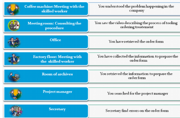
Fig. 5. PEGASE screenshot: reminder for the player's tedious tasks