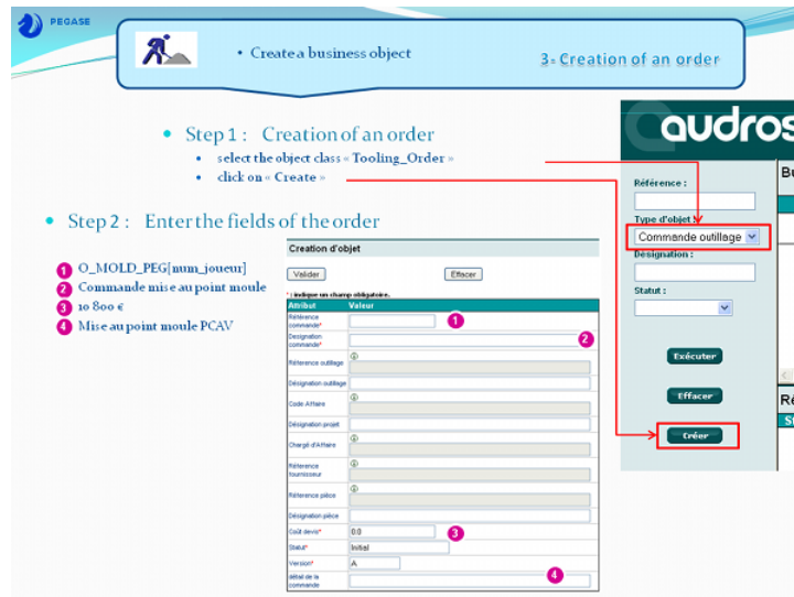
Fig. 6. PEGASE screenshot: a player interacting with Audros system