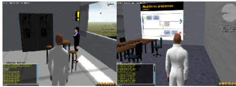
Fig. 4. PEGASE screenshot: a player interacting with the game environment