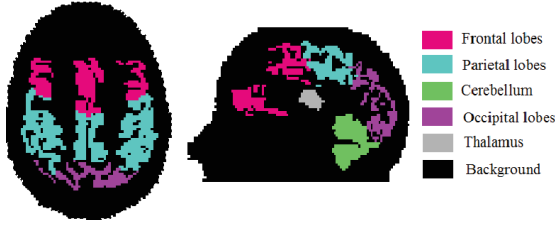
Fig. 1. Regions of the Zubal head phantom used for image simulation.