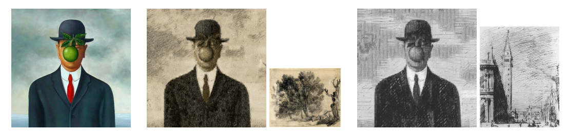
Figure 5. Illustration of example-based style transfer for sketches. From left to right: original image from Magritte and the result of our algorithm using as example the smaller sketches at the right. In this example texture as well as color are very important to reproduce the style.

Figure 4. Comparison with state-of-the-art. It can be observed that our method captures the prominent texture and color features from Van Gogh's painting, with an overall accurate reconstruction of buildings. The method of [2] captures partially the brushwork texture from the painting, but the buildings are not well reconstructed. The method of [13] captures accurately the painting colors, however it does not reconstruct all main structures in the original image (buildings in bottom left), and the brushwork textures are not noticeable in the result image, which has a rather blurry effect in the sky.