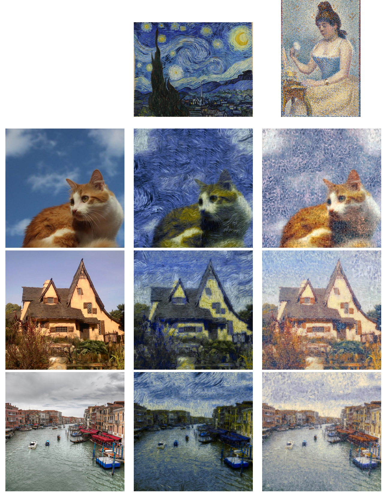
Figure 6. Illustration of our example-based style transfer for different painting styles. Example images from van Gogh's and Seurat's are on the top and original images are on the left. Our algorithm transfers successfully the style for different texture scales and it preserves the image geometry of the original images.