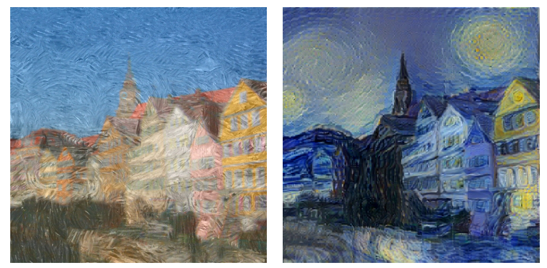
Unsupervised Patch table [2]