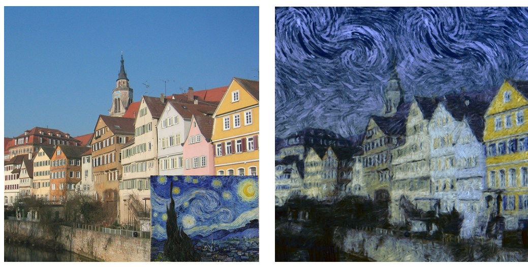
Original and Example