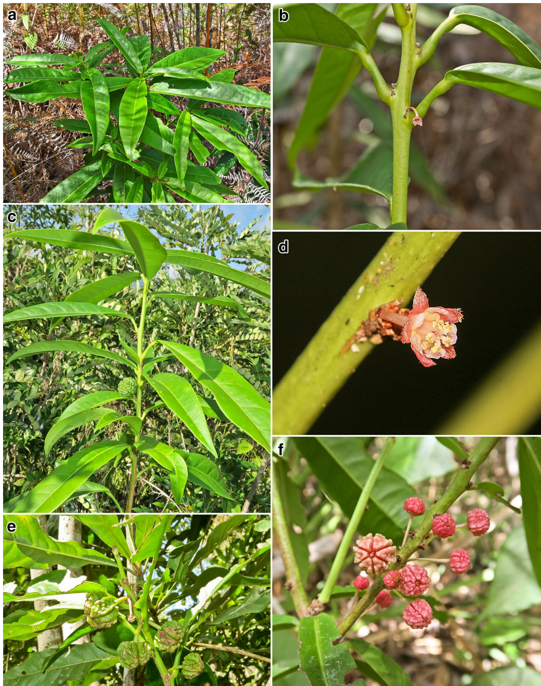
Fig. 1 Actephila alanbakeri in the native habitat (a), habit of the plant with inflorescences (b), habitat of the plant with infructescence (c), close-up of inflorescence (d), ripe infructescences (e), closeup of young infructescences (f).

in other hotspots for Ni hyperaccumulator plants, such as in New Caledonia and Cuba (Reeves 2003). These families, except the Rubiaceae, are all in the order Malpighiales (Angiosperm Clade Rosids). The large family Phyllanthaceae (over 2000 species in 60 genera) has its centre of diversity in the Malesia and Australasian