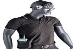
Fig. 2. Transcranial Doppler system (TCD-X, Atys Medical, Soucieu en Jarrest, France)