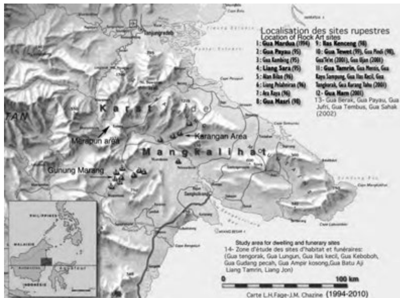
Fig. 1. A complex hierarchical cavity net use

uplifted from tectonic pressure movements after the Myocene, some 60 millions years ago, have developed a common feature consisting in three main geomorphological networks of cavities and galleries. The third one, has not been that much uplifted and being lower, comprises more or less only two main nets of cavities.