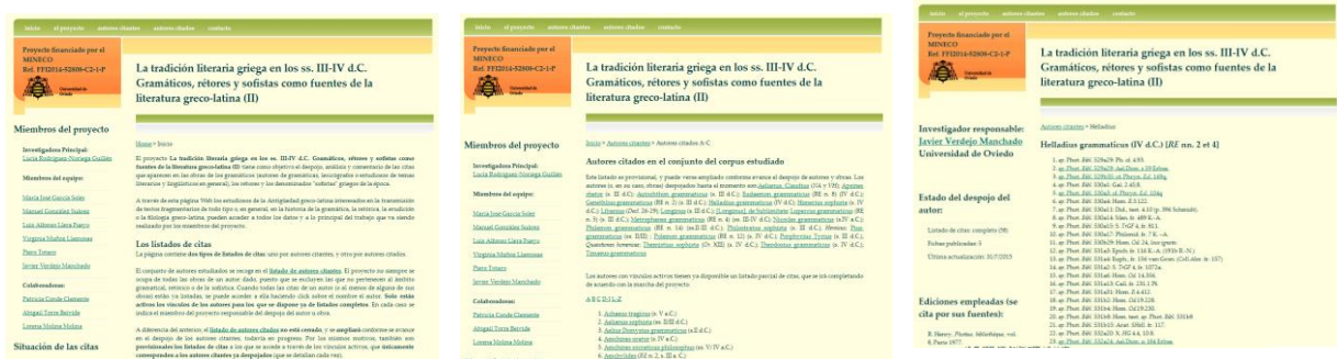
Figure 1. The Project web site.