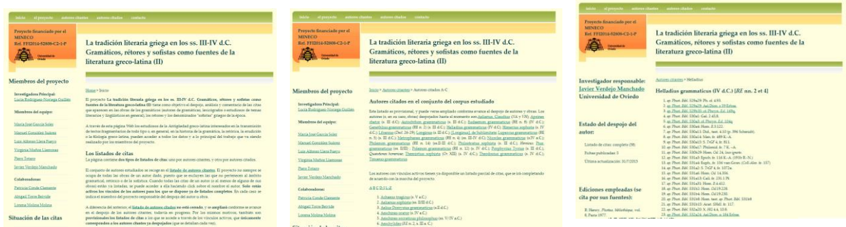
Figure 1. The Project web site.