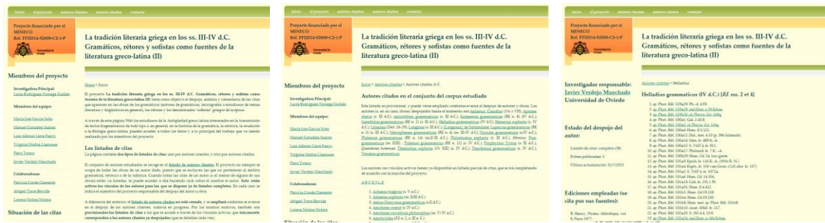
Figure 1. The Project web site.