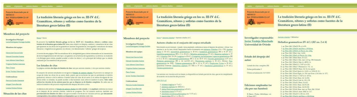
Figure 1. The Project web site.

Unlike in the case of the quoting authors, the catalogue of quoted authors is still open and provisional, and so, of course, are the corresponding lists of quotations. Up to now, we have found quotations from more than 400 authors, both Greek and Roman.