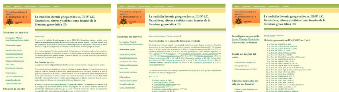
Figure 1. The Project web site.

Unlike in the case of the quoting authors, the catalogue of quoted authors is still open and provisional, and so, of course, are the corresponding lists of quotations. Up to now, we have found quotations from more than 400 authors, both Greek and Roman.