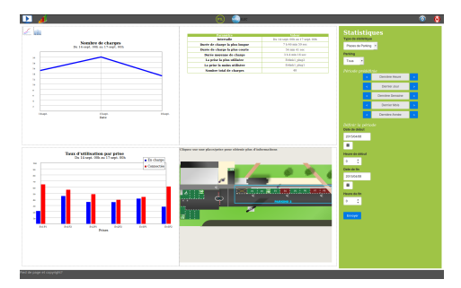
Figure 4. Statistics Interface

Figure 4 shows the statics view of the application. The user can select some parameters for statistics computations and sends a new request to the statistics object (encapsulating the database). As soon as calculations are done, the interface is updated according to the new computed values. Chart objects are used to draw histograms, plots and pie charts.