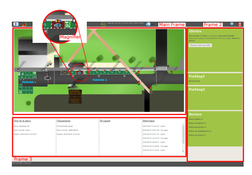
Figure 3. Live Interface