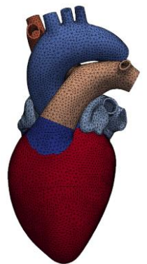
Figure 1. Whole heart finite element model.

The whole heart model used here was created from normal human computed tomography and magnetic resonance data [4]. It contains the four cardiac chambers, and main blood vessels. The geometry is discretized using linear tetrahedrons. The mesh is shown in Figure 1. A normal myofiber distribution was defined onto the mesh [4].