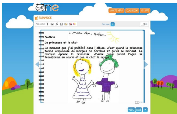
Figure.2. Example of pedagogical use of the Multimedia Notebook on VLE ONE.

of a 7 years aged student, made on the VLE ONE. These answers may help us know what the priorities of users are and how they relate to the technology when it is first introduced, what use they represent in first and what activity they experiment. The advantage of this kind of model is that it proposes a large exploration of the subject of acceptance, through different angles of research and complementary methods (qualitative and quantitative). Another advantage is the fact that it may restore multiple points of view of educational community members: teachers, students and parents and the relation between these members. It permits a focus on different actors and their specific needs and characteristics.