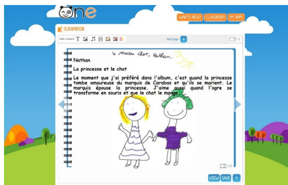
Figure.2. Example of pedagogical use of the Multimedia Notebook on VLE ONE.

of a 7 years aged student, made on the VLE ONE. These answers may help us know what the priorities of users are and how they relate to the technology when it is first introduced, what use they represent in first and what activity they experiment. The advantage of this kind of model is that it proposes a large exploration of the subject of acceptance, through different angles of research and complementary methods (qualitative and quantitative). Another advantage is the fact that it may restore multiple points of view of educational community members: teachers, students and parents and the relation between these members. It permits a focus on different actors and their specific needs and characteristics.