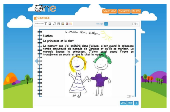
Figure.2. Example of pedagogical use of the Multimedia Notebook on VLE ONE.

of a 7 years aged student, made on the VLE ONE. These answers may help us know what the priorities of users are and how they relate to the technology when it is first introduce, what use they represent in first and what activity they experiment. The advantage of this kind of model is that it proposes a large exploration of the subject of acceptance, through different angles of research and complementary methods (qualitative and quantitative). Another advantage is the fact that it may restore multiple points of view of educational community members: teachers, students and parents and the relation between these members. It permits a focus on different actors and their specific needs and characteristics.