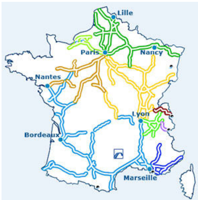
Map 2: Motorway network