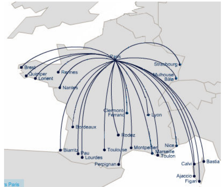
Map 3: Air France national network (from/to Paris)