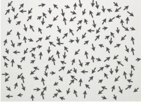
Figure 1. Randomly oriented gravitational dipoles (in absence of an external gravitational field)

observed [9, 10] and presents a surprise and mystery for dark matter paradigm.