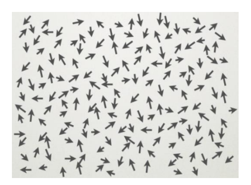
Figure 1. Randomly oriented gravitational dipoles (in absence of an external gravitational field)

observed [9, 10] and presents a surprise and mystery for dark matter paradigm.