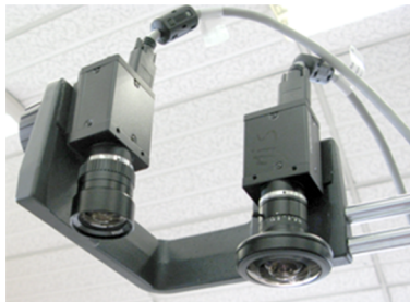
Figure 1: An example of a hybrid stereo rig: perspective and fisheye cameras.

Main application fields of hybrid stereoscopic systems are video surveillance and localization or navigation in robotics. For instance, a perspective and fisheye cameras stereo rig is mounted on a UAV (Fig. 2) to estimate its altitude thanks to both images and a plane-sweeping algorithm [1]. The attitude of the UAV is estimated thanks to the fisheye view using the horizon line when possible or 3D