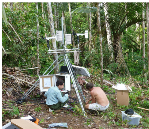
Fig. 4 Installation of an automatic weather station in the tropical rainforest in French Guiana. Long-term monitoring of environmental conditions in remote forest inventory plots is a prerequisite to understand the effect of seasonal or extreme drought on tree and ecosystem functioning and simulate future changes

Most studies published so far have addressed the short-term consequences of extreme droughts; only very few (mainly experimental through-fall studies) have attempted to evaluate their long-term impact (Fig. 4). Despite their tremendous value in the study of response mechanisms, experimental studies cannot mimic the impact of successive, high-frequency major