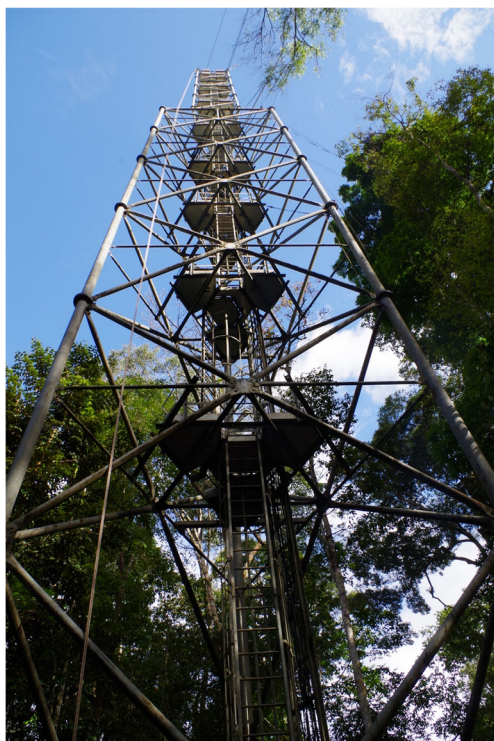
Fig. 3 The 55-m high eddy flux tower set up in 2003 in French Guiana (Bonal et al. 2008). Equipment installed on top of the tower (above the canopy) allows to continuously monitor the gas exchange ( \text{CO}_2 , \text{H}_2\text{O} ) between the atmosphere and the considered ecosystem (around 50–100 ha)

Under extreme drought conditions, GPP is generally moderately further impacted by these extreme conditions, while the decrease in ER is usually much stronger than under recurrent seasonal droughts (synthesized in Shi et al. 2014). This suggests that drought severity could be driving the relative decrease in GPP and ER in these ecosystems. If this is verified, such patterns should be included in modelling approaches. A question which merits further attention then arises: what is the future of the carbon that is not released during severe dry periods, as compared to moderate dry ones? Is this carbon directly released to the atmosphere once heavy rainfalls occur or is it, partly or completely, stored in the ground?