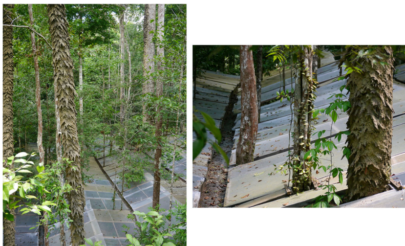
Fig. 2 The rainfall exclusion experiment in Caxiuana National Forest Reserve, Brazil

review of these recent studies and discuss whether we are currently able to evaluate the response of tropical rainforests to the future climate conditions in these regions. We also synthesize the existing knowledge on the mechanisms leading to these effects. Considerable knowledge has been accumulated on the physiological attributes of tropical rainforest tree species and their ability to support drought events. A review of this present knowledge would be highly valuable, but to keep the scope of this article within acceptable limits, we concentrate on community- and ecosystem-level responses to drought, rather than on tree- or species-level responses. We include 172 papers in this review, among which 88 were published over the past 5 years (2010–2015).