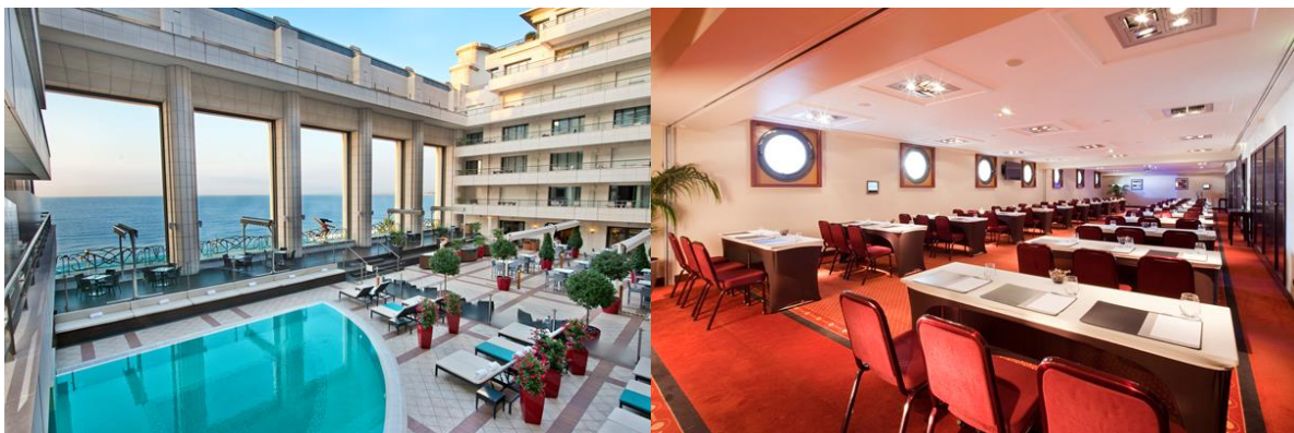
Palais de la Méditerranée – 3rd floor : terrace and room Pasodoble