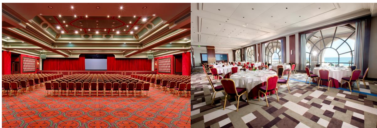
Palais de la Méditerranée – 1st floor : room Vénitien and Azur