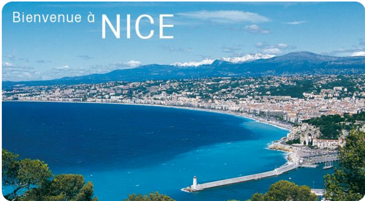
The “French Riviera” between Sea and Mountains

The French Riviera (La Côte d'Azur) is a cosmopolitan Mediterranean destination situated at the heart of Europe. It enjoys a climate blessed by the gods with over 300 days of sunshine per year. Its unique natural environment, intense light and mild climate are key attributes of the stylish living synonymous with the French Riviera . Land of exception and emotion, the French Riviera owes much of its success to extraordinary diversity and wealth. A unique identity forged by the contrast between sea and mountains. The French Riviera owns a wonderful cultural heritage, an abundant crucible of creative activity for artists from all over the world, a profusion of international festivals and large events, and gourmet food bursting with sunshine given a contemporary twist by the greatest chefs.