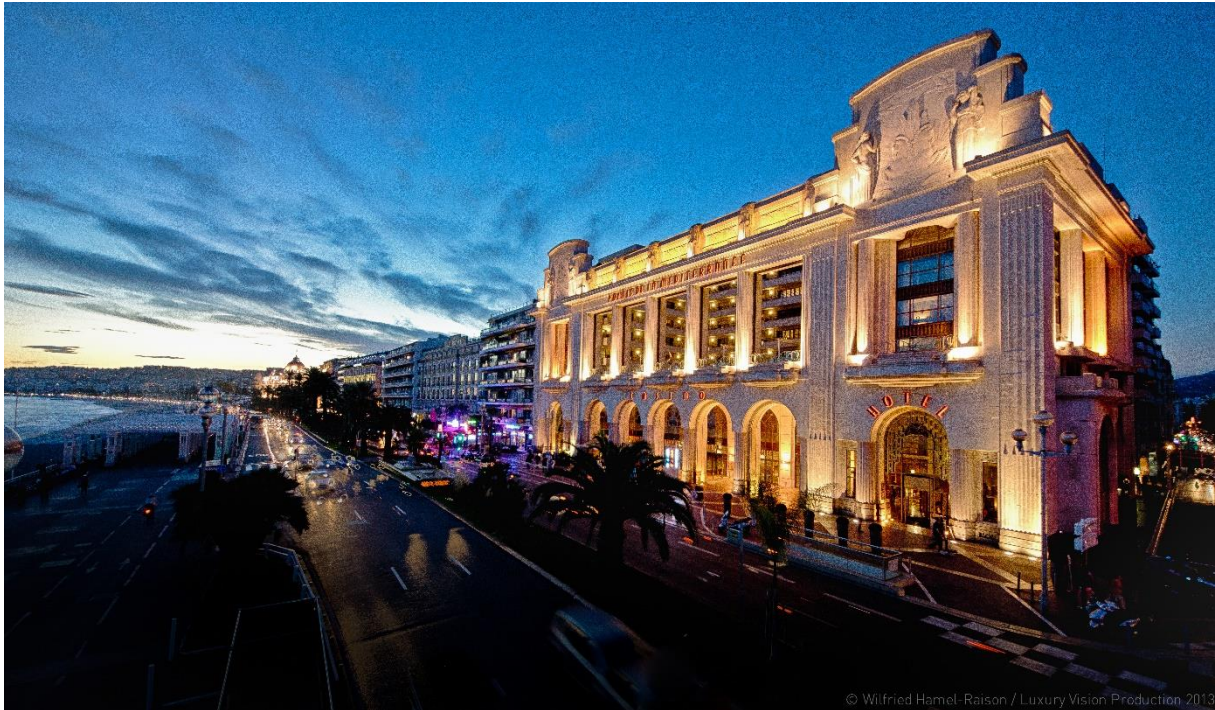
Hyatt Regency Nice Palais de la Méditerranée

Hyatt Regency Nice Palais de la Méditerranée is an ideal site to hold meetings and conferences at the heart of the Mediterranean region. The hotel offers seven rooms providing a nearly unlimited choice of size, set-up and function to ensure a perfect fit with any event.