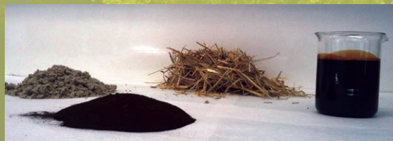
Fig. 2 – From left to right: cellulose, powder lignin, wheat straw, C5 syrup (hemicellulose).

to breakdown the biomass into its component parts, cellulose, lignins and pentose sugars from feedstocks, such as wheat straw, birchwood or poplar. The pentose sugars are obtained in an impure liquid stream that also contains glucose, proteins, phenolic compounds, minerals and acids from the extraction process. It is this biorefinery stream that BIOCORE researchers are using as a raw material to imagine new technologies and products.