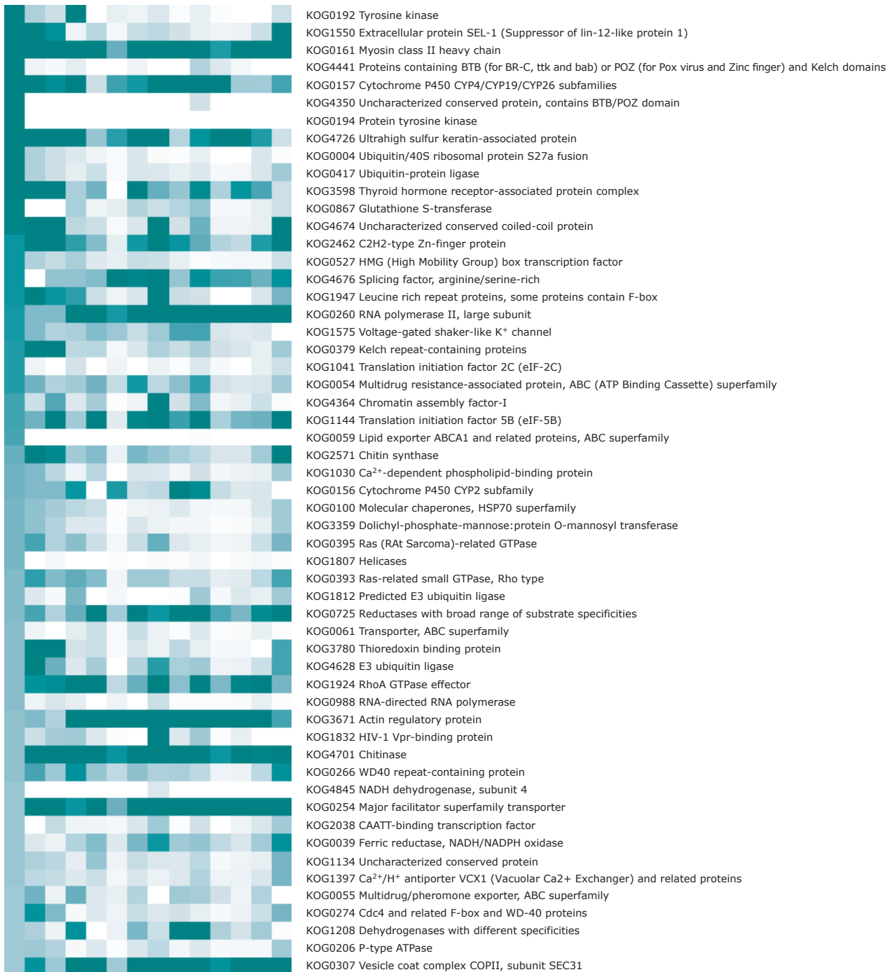
Fig. 1 Most abundant Eukaryotic Orthologous Groups (KOG) domains in Glomus intraradices compared with representative saprotrophic (black circle), pathogenic (black square) and mutualistic fungi (open circle). The heatmap is based on the relative z-score of KOG conserved domains. The top 55 KOG domains found in G. intraradices were selected. Colors indicate abundance: from dark green (highly abundant) to white (weakly abundant). An, Aspergillus nidulans ; Bc, Botrytis cinerea ; Bg, Blumeria graminis ; Cn, Cryptococcus neoformans ; Lb, Laccaria bicolor ; MI, Melampsora larici-populina ; Mg, Magnaporthe grisea ; Mc, Mucor circinelloides ; Nc, Neurospora crassa ; Pc, Phanerochaete chrysosporium ; Ro, Rhizopus oryzae ; Tm, Tuber melanosporum ; and Um, Ustilago maydis .

○ ■ ● ○ ■ ● ■ ■ ● ■ ■ ● ○ ■ Gi Mc Ro Lb Cn Pc Um MI An Bc Mg Nc Tm Bg