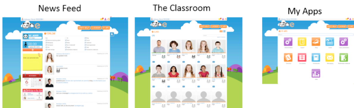
Figure 2. Interfaces for the pages « News Feed » « The Classroom » and « My Apps » in the VLE One

The VLE used in this study is entitled One. It was specifically designed for an elementary school audience, with ergonomics and interfaces that are suitable for children (Budi and Nielsen, 2010, Lueder and Rice 2007). The One interface is therefore simple, intuitive and attractive (see Figure 2). The collaboration functions that are offered consist in a Messaging Service, a Blog and a Storage Space. One also offers customization features (My Account, My Mood), notifications (a News Feed, birthday notifications), organizational tools (Calendar) and a school website. Each user has the option of customizing his/her profile with a picture and personal information (motto, mood, information on favourite leisure activities, films, music, food). Students are by default included in their class group and have access to the content published in the