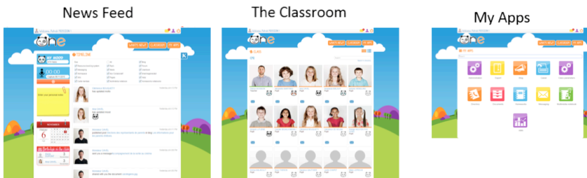
Figure 2. Interfaces for the pages « News Feed » « The Classroom » and « My Apps » in the VLE One

The VLE used in this study is entitled One. It was specifically designed for an elementary school audience, with ergonomics and interfaces that are suitable for children (Budiu and Nielsen, 2010, Lueder and Rice 2007). The One interface is therefore simple, intuitive and attractive (see Figure 2). The collaboration functions that are offered consist in a Messaging Service, a Blog and a Storage Space. One also offers customization features (My Account, My Mood), notifications (a News Feed, birthday notifications), organizational tools (Calendar) and a school website. Each user has the option of customizing his/her profile with a picture and personal information (motto, mood, information on favourite leisure activities, films, music, food). Students are by default included in their class group and have access to the content published in the