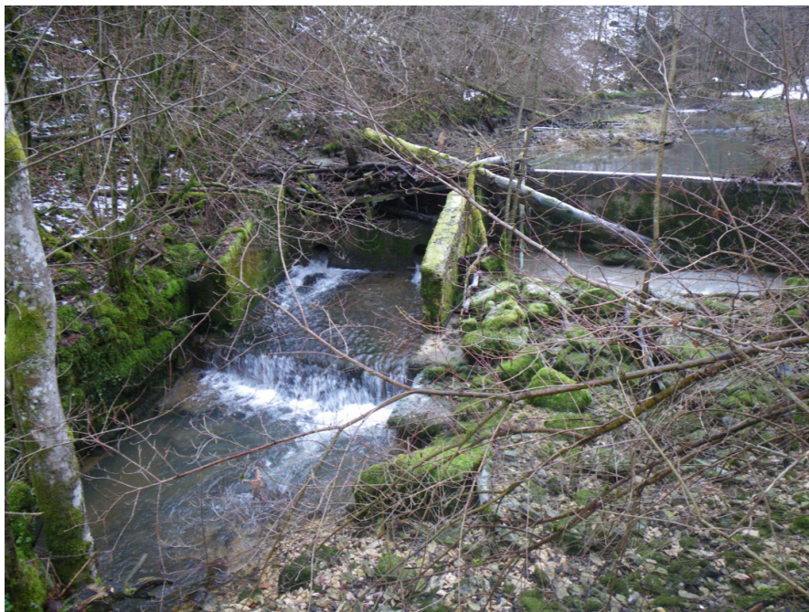
Fig. 3. Photo of 2 m high dam with outfall pipes in the bottom located in upstream section.