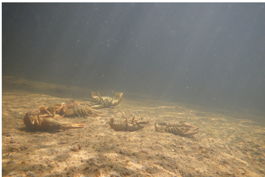
Fig. 1. Photo of dead crayfish found in sector A, 17 July 2014.