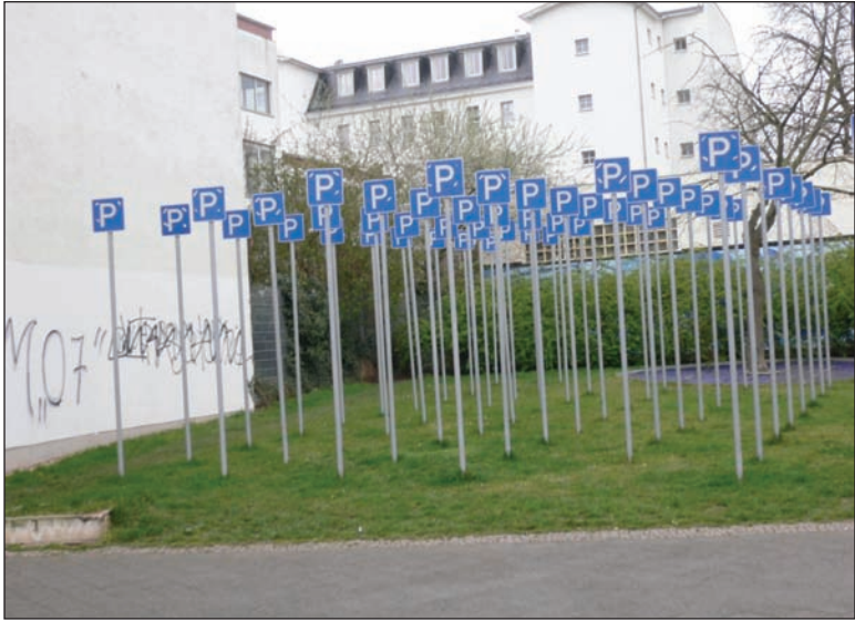
Illustration 4: Stattpark, an art project sponsored by Urban II.